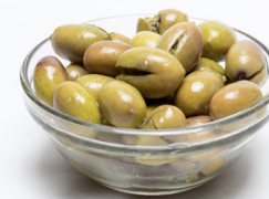
olives from Greece