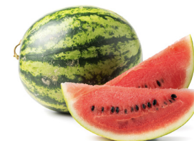
watermelons from South Africa