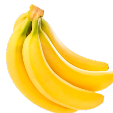
bananas from Brazil