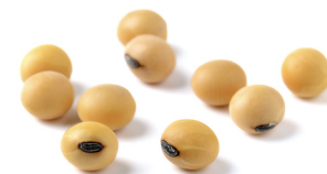
soya beans from Canada