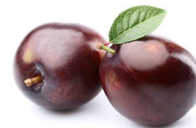
plums from China