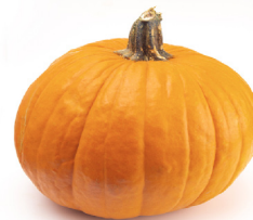
pumpkins from Mexico

Orange and yellow: vitamin A, vitamin C and fibre.