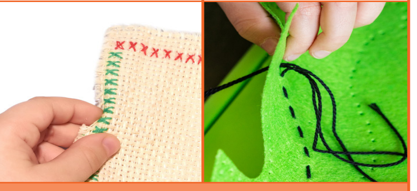
Remember to tie a knot in your thread so that the stitches stay secure and do not come undone!