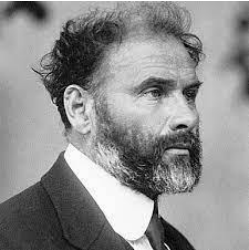
Gustav Klimt (14 July 1862 – 6 February 1918) was an Austrian Symbolist painter.