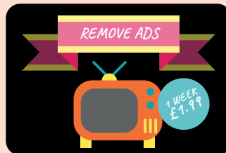
pay to stop advertisements