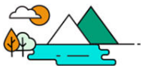
Cleans water and air

We can think of the whole world as our environment – from green spaces near where we live, to faraway forests and oceans. Our environment is where we get everything we need to survive and it does so much for us.